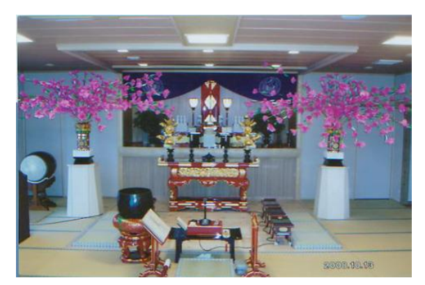
New altar at Sanbo-in Tempe, Fukuyama, Japan